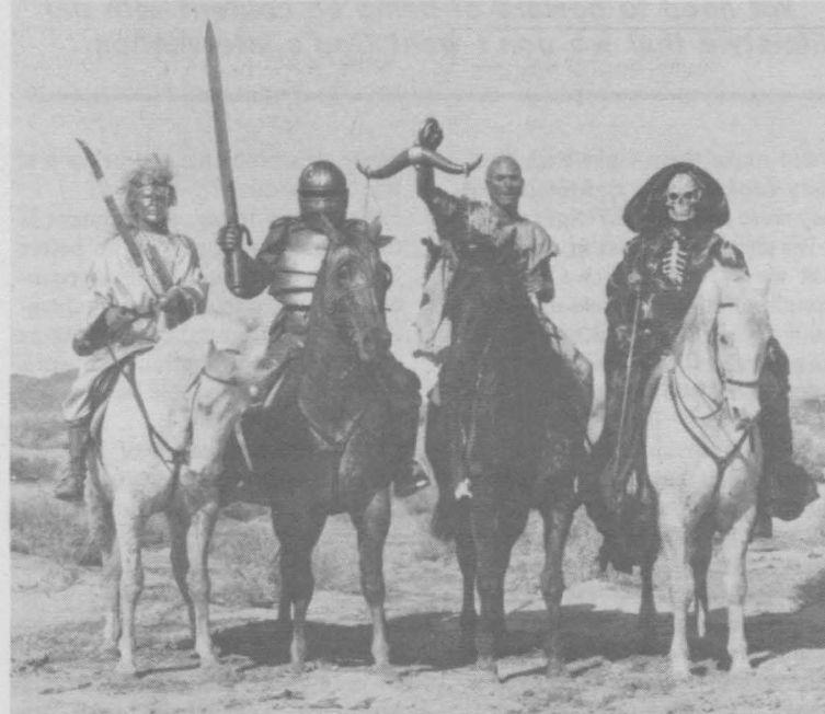
GRIM HORSEMEN—These actors and horses were filmed Feb. 3 and 4 for a segment in a World Tomorrow telecast on the four horsemen of the Apocalypse to be aired March 19 and 20.